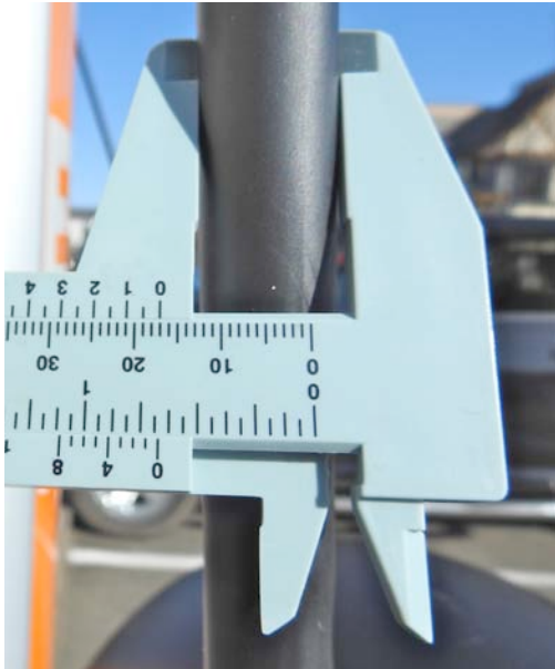
Chargepoint cable outside dimensions = 17mm