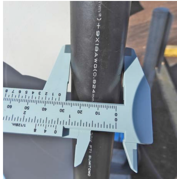
DC Fast Charger cables are much larger and have more of the smaller gauge Data wires